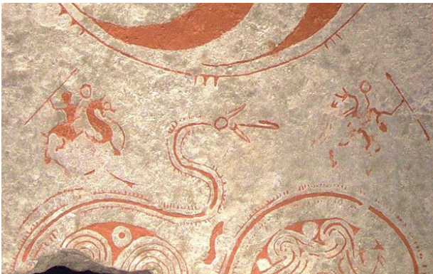
Figure 1. Martebo Church (G 264).

From the earliest periods, Lindqvist's group Aa, now understood to include the 2 nd through the 6 th centuries, 15 such drakorm images as Martebo Church (G 264) (Fig. 1) and Hangvars Austers I, for example, testify to the popularity of the dragon-snake motif within the island's art traditions. For the most part, these depictions appear to fall well within the adversarial dragon tradition. 16 A related, but much more complex and divergent, use of drakormar is also one of the best-known Gotlandic picture stones to the world at large, namely, the remarkable monument from Smiss in När Parish, discovered in 1955, sometimes called the "snake witch stone" (Swedish ormhäxan , alt., ormtjuserskan ). 17 När Smiss III (Fig. 2) is usually dated to the 6 th to 7 th centuries (although some have suggested that it might be from as early as the 5 th century). 18 In it, rather than the dominating central whirling solar figures on Martebo Church (G 264) and Hangvars Austers I, När Smiss III