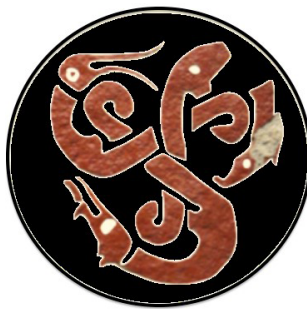
Figure 5. När Smiss III triskele presented in the style of an ornamental disc.

This legendary text as a whole has been the subject of much discussion over the decades, 37 and although its immediate context – the Laws of Gotland – suggests that it largely functioned as a framing device for these important documents, few doubt that much of the material in the history offers us insights into the early