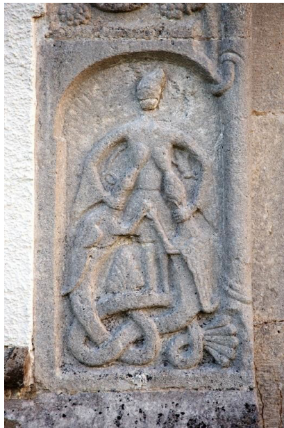
Figure 3. Väte Church, Gotland. 23

It has sometimes been suggested that such scenes are legacies of a pre-Christian belief in Terra mater , the earthmother, nursing beasts, including serpents. Another, and in my opinion likelier,