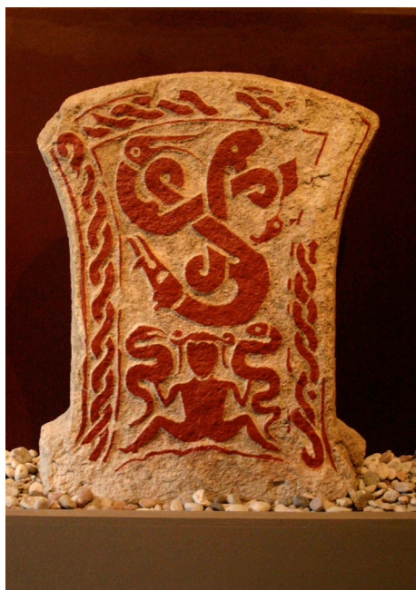
Figure 2. När Smiss III.

has instead a large triskele of three animals, often interpreted as a boar, a raptor, and a drakorm . Beneath this group is the figure of a human, generally, although not always, believed to be a woman, legs outstretched, holding two differing drakormar , one in either hand.