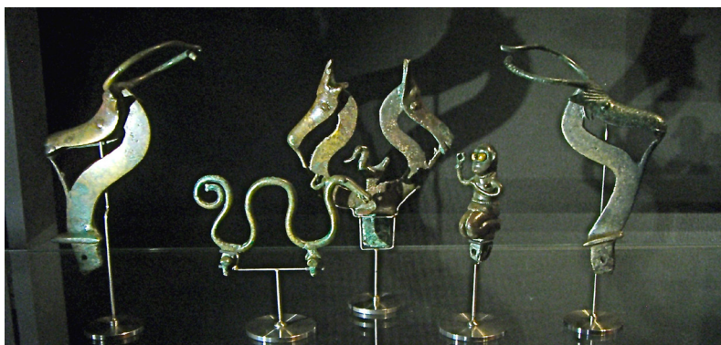
Figure 6. Bronze Age votive figures from Fårdal, Denmark.

drinking/suckling – consists of some five bronze pieces (Fig. 6), among them, a kneeling woman and a serpentine beast: