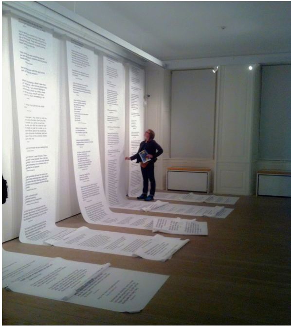
Figure 5. Text collages, Today's Cake is a Log . Hotel Pro Forma, 2015. Photo: Kim Skjoldager-Nielsen. Copyright: Hotel Pro Forma. License: CC-BY-NC-ND.

new texts. Our playful displacement of the texts in space enacts once again the staging device of simple orchestration, while at the same time, the text medium of the performances is remediated as a social artefact to engage the visitors.