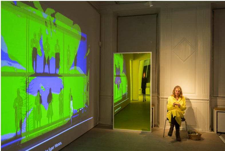
Figure 4. Mirror room, Today's Cake is a Log . Hotel Pro Forma, 2015. Photo: Torben Eskerud. Copyright: Hotel Pro Forma. License: CC-BY-NC-ND.