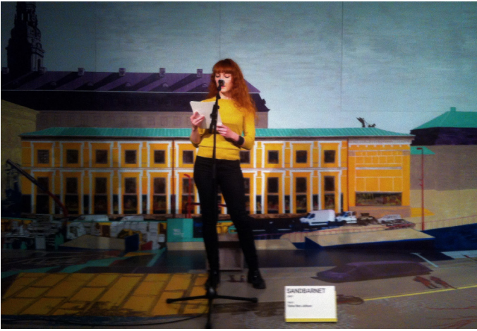
Figure 8. Readhead reader, Today's Cake is a Log . Hotel Pro Forma, 2015. Photo: Daria Skjoldager-Nielsen. Copyright: Hotel Pro Forma. License: CC-BY-NC-ND.

flaming red hair (Figure 8). She stands by a microphone against a painted background depicting the cityscape outside, behind the very same wall: the parliament building Christiansborg, the traffic in the street, and the ongoing metro construction. The painting covers the entire wall and part of the floor, suggesting that she belongs to the other world, the world of the artworks. She makes eye contact with us but, busy reading a text, she does not greet us. A sign stands on the floor with the title “The Sand Child / 2007 / Text / Tahar Ben Jelloun” indicating the performance whose text she is reading and the author of that text. She is sharing the story with the listener, but at the same time she is observing the audience sitting and standing in front of her. Dressed in her private clothes, she could be just anyone from the audience, as if anyone could take her place. Only those who know Hotel Pro Forma’s works very well will recognize her as one of their performers, but again that is of no real importance. The sense that any of the visitors could replace her is important, as it points to appropriation as a staging device applied to the performers, who often retain an authenticity whether it is through their appearance, skill, or known history.