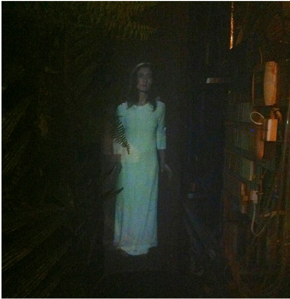
Figure 7. The ghost, Today's Cake is a Log . Hotel Pro Forma, 2015. Photo: Daria Skjoldager-Nielsen. Copyright: Hotel Pro Forma. License: CC-BY-NC-ND.

the opening of a narrow crevice in the wall. One of the inside walls is covered by green plants and ferns and the other one by humming machines; medialities of life and lifelessness confronting each other. At first this contrast grabs the attention, but the main clue of the installation is yet to be revealed. A thin woman dressed in white is hidden deep in that space. She stares at us and stretches her hands as if she wanted to be held or rescued from this strange space. She is scarily beautiful and seems very real. Only a close look reveals that she is in fact a video projection on a loose canvas waving in a slight breeze. She is a ghost, caught between life and death. The display has no plaque referring to any performance; but the experience it creates is reminiscent of Hotel Pro Forma's work with visual illusion, whether produced by technology or mere perspective (as in the 1989 Why Does Night Come, Mother ).