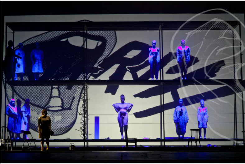
Figure 2. War Sum Up . Hotel Pro Forma, 2011. Photo: Roberto Fortuna. Copyright: Hotel Pro Forma. License: CC-BY-NC-ND.

behind the stagnant opera singers posing on a scaffolding or on the proscenium (Figure 2).