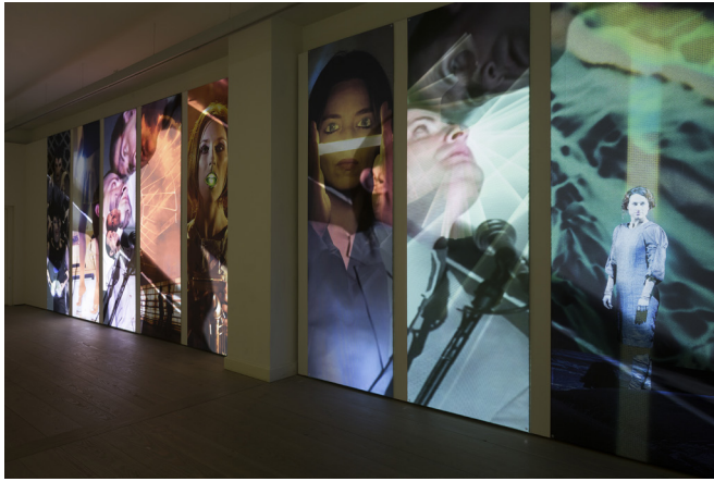
Figure 6. Photo/video montage, Today's Cake is a Log . Hotel Pro Forma, 2015.

the point of view. The contingency of perspective that Hotel Pro Forma explores is hinted at through the embodied perspective of the visitor and her possibility to shift it.