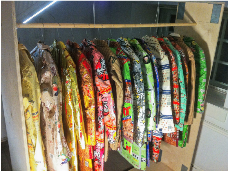
Figure 3. Clothes rag, Today's Cake is a Log . Hotel Pro Forma, 2015. Photo: Daria Skjoldager-Nielsen. Copyright: Hotel Pro Forma. License: CC-BY-NC-ND.